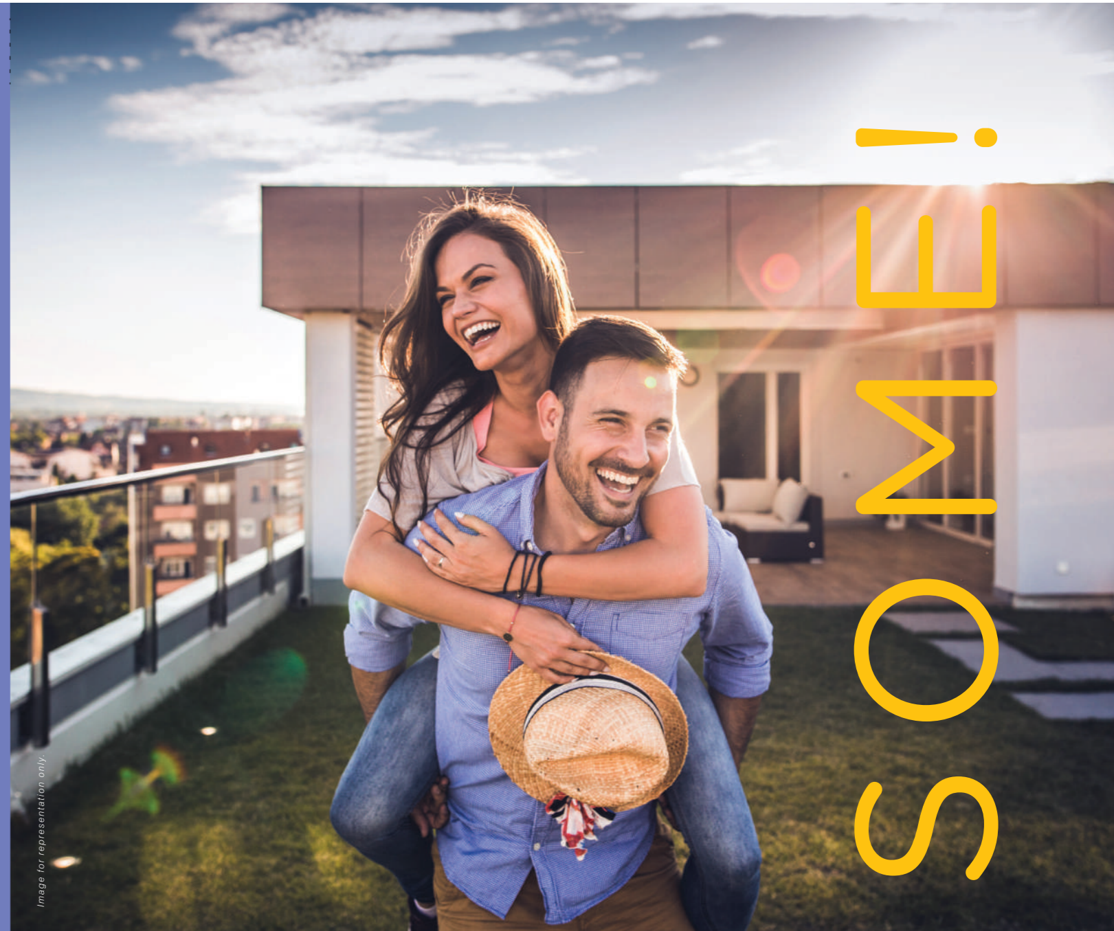
Image for representation only